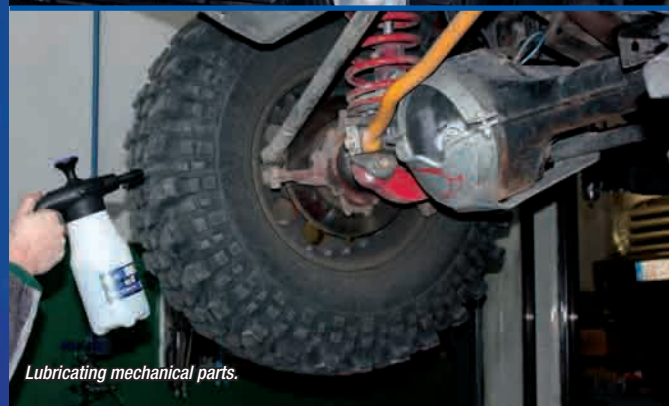
Lubricating mechanical parts.