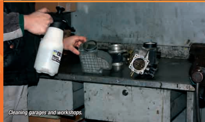
Cleaning garages and workshops.