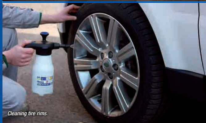
Cleaning tire rims.