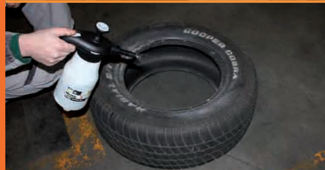
Cleaning and regenerating tires.