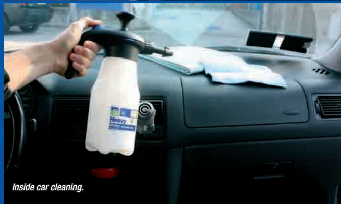
Inside car cleaning.